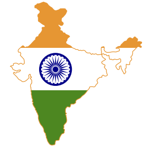
INDIA & SUBCONTINENT